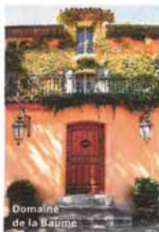
Domaine de la Baume